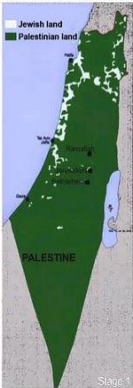
Palestinian and Jewish land 1946